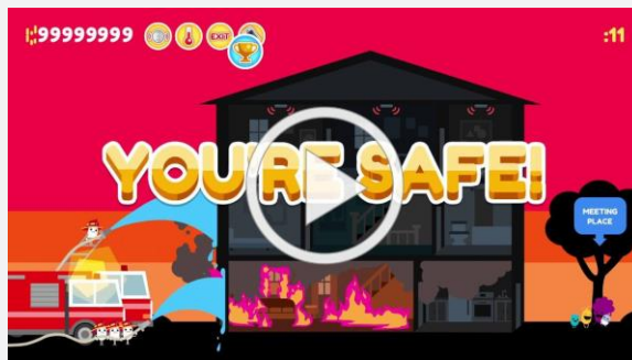
Every second counts in a home fire!