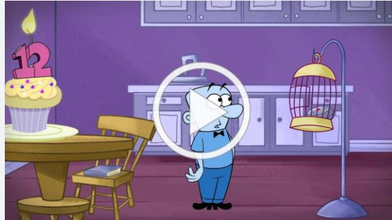
Smoke Detectors Dan Doofus: An Alarming Trend

Our colleagues at the National Fire Protection Association (NFPA) have created some fun and informative videos that will be sure to inspire your kids to get involved in testing your smoke detectors and planning your home fire escape plans.