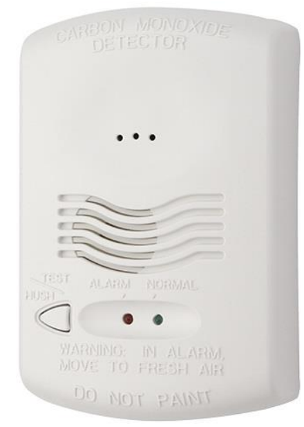
Huronia Alarm & Fire Security Inc. installs and services monitored smoke and carbon monoxide alarms.

For more fire safety tips or to find out about monitored fire and carbon monoxide alarms, <u>visit our</u> <u>website</u>.