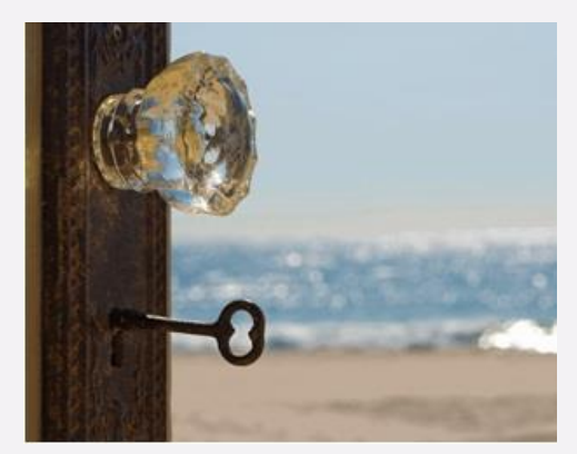
Huronia Alarm & Fire Security Inc. Vacation Safety Tips