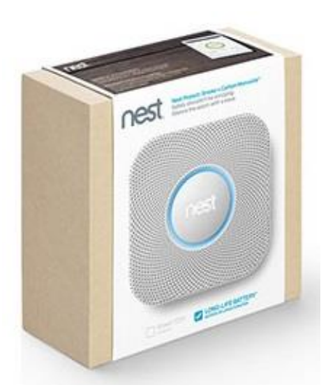
NEST Protect, now available at Huronia Alarm & Fire Security Inc.

Now there is. It's called <u>NEST Protect</u> and Huronia is your source to get it.